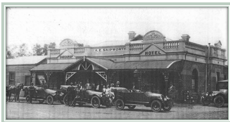
Dardanup Hotel which was rebuilt in 1905 after a fire.