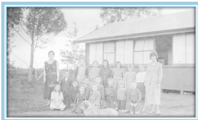
Paradise School in the 1920's.

The Shire's Municipal Heritage Inventory contains a list and details of places considered to be of local heritage significance.