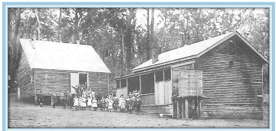
Wellington Mills School – 1907 Source: Wellington Mills – A History, 2004

awareness and celebratory programs to foster a community culture that will value the Shire's remaining heritage assets