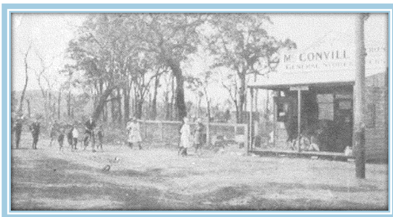
Burekup Store – c. 1918

The Heritage Strategy will be reviewed annually with the review of other strategic plans such as the Corporate Business Plan. A major review should be undertaken every four years.