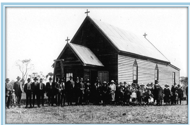
Opening of the Waterloo Catholic Church. The Church was the St Matthew's Church at Wellington Mills until being relocated to Waterloo in 1924.