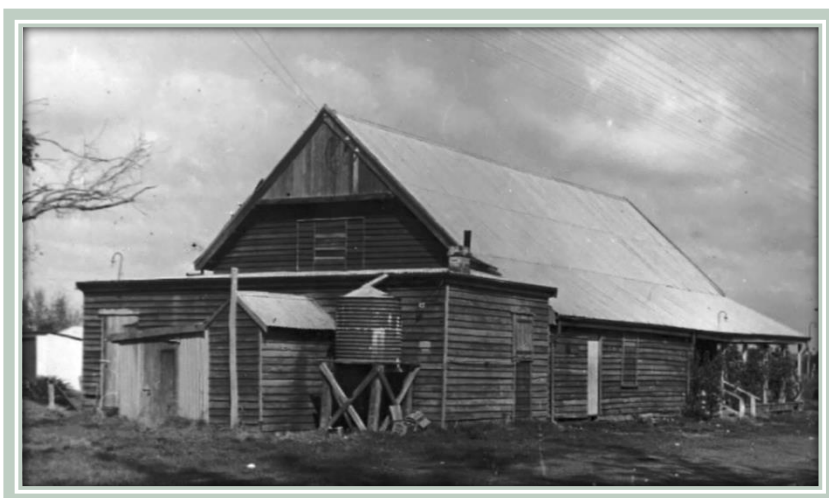
Original Dardanup Hall which was used from 1890 to 1956.