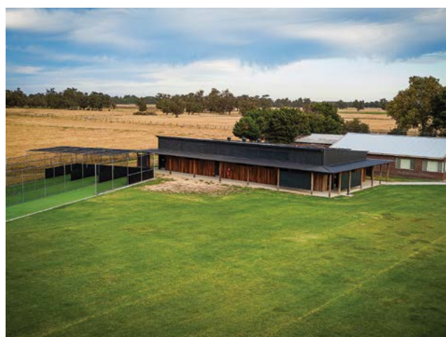
Project Wells Recreation Park Redevelopment - 2021