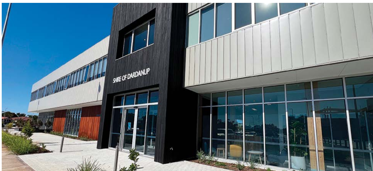
Project Eaton Library, Administration and Community Building - 2024

The Shire of Dardanup has a proven track record with progressing major projects over the last five years, which includes: