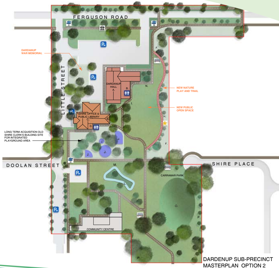
DARDENUP SUB-PRECINCT MASTERPLAN OPTION 2