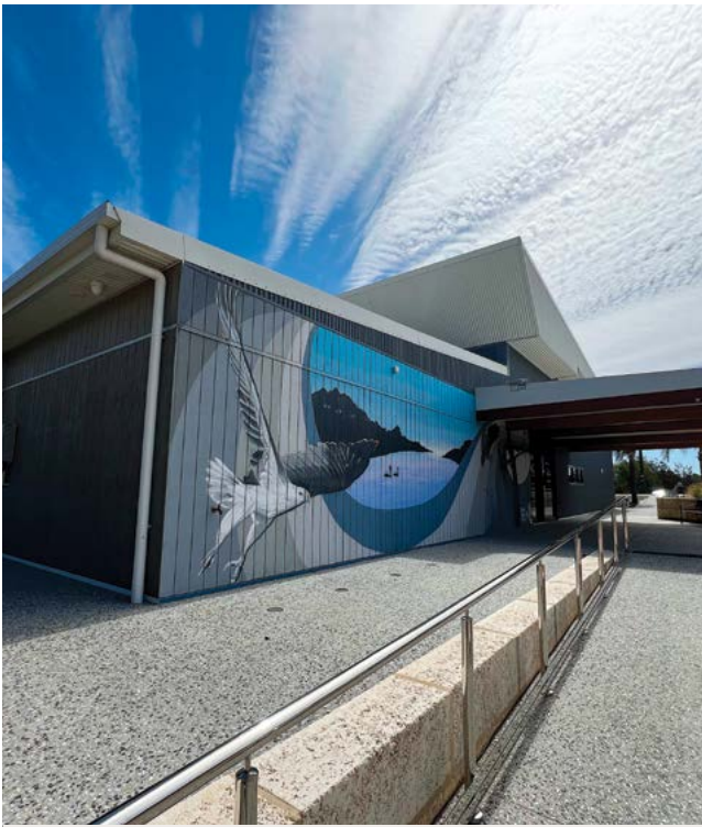
Project Eaton Bowling Club and Senior Citizens Centre - 2022