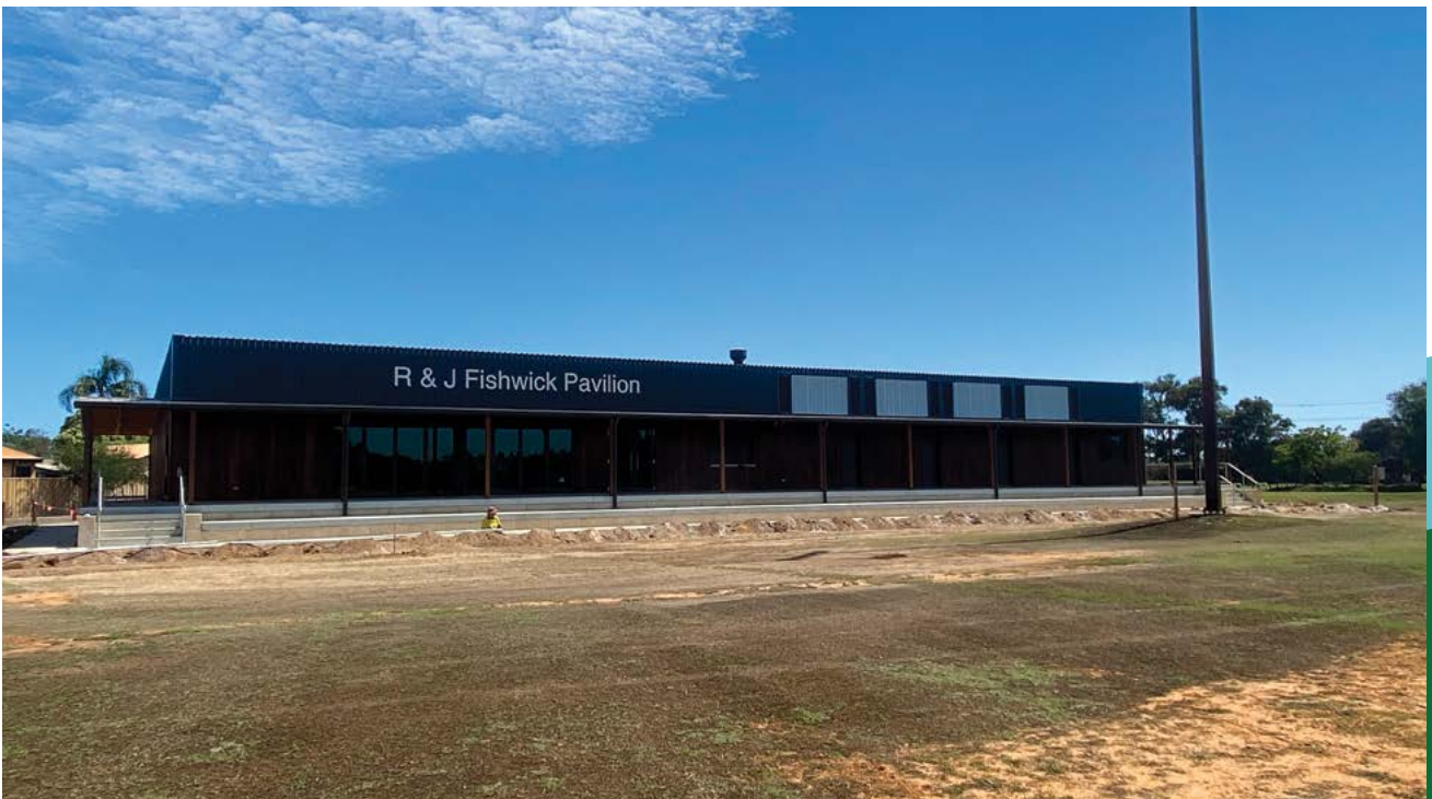
Project Eaton - R&J Fishwick Pavilion (Junior Football Club and Cricket Club) - 2023