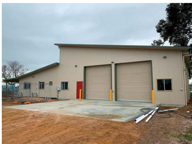
Project Dardanup Centrals Volunteer Fire Brigade and Wells Change Rooms Building - 2022