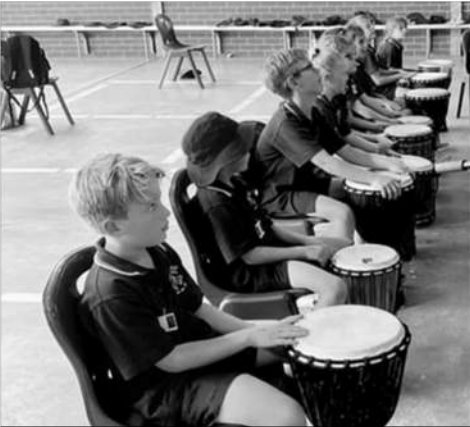
Year 3 Playing the Djembe drums from West Africa.

Dardanup Primary School hosted Harmony Day with Our Lady of Lourdes' students. It was a wonderful celebration of Australian multiculturalism, and the successful integration of migrants into our community. Australia is one of the most successful multicultural countries in the world and we celebrate and work to maintain it! The message of Harmony Week is everyone belongs. Having our two schools work together epitomises the true meaning of belonging!! Photos depict some activities students participated on the day.