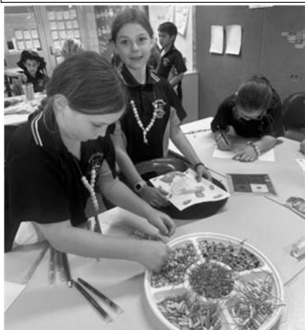
Year 4 Friendship bracelets and necklaces symbolising everyone belongs.