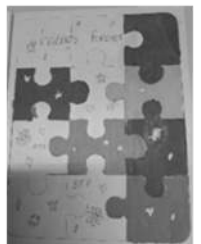
Year 3 creating Harmony Day slogans on their wooden jig saws.