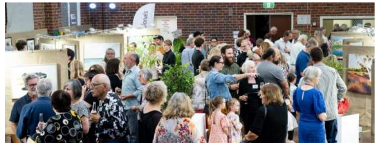
A Record Crowd At Friday Night Opening

The Dardanup Art Spectacular Art Trail held on 20 th & 21 st April attracted hundreds of art lovers to venues in Dardanup, Ferguson Valley and Crooked Brook. Historic buildings, home studios and wineries hosted 32 artists giving visitors the opportunity to meet the creators behind the many mediums on display. In addition, a trail of more than 30 sculptures as part of the Ferguson Follies Sculpture Trail was coordinated by Peppermint Lane Lodge on their idyllic property as part of this annual event.