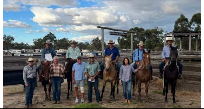
Pictured are the top 5 place getters all returning their winnings to the fundraiser.