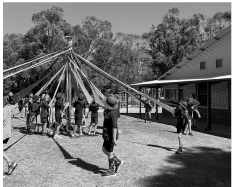
Year 5 students with the Maypole