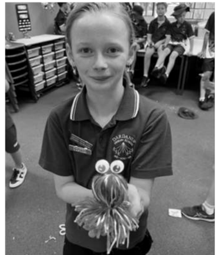
Year 6 Happy Harmony Day Hooligans.