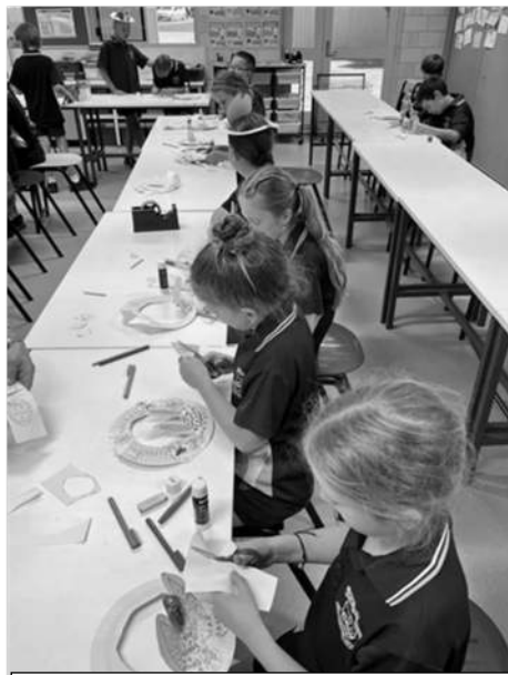
Year 5 Easter Bonnets USA style.