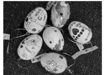
Pre-Primary decorating their Faberge Easter eggs. Very sparkly!!