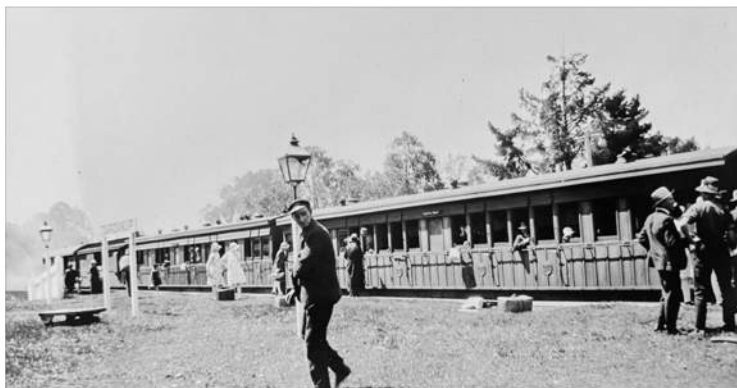
Dardanup Railway Station 1928

For more information and photos of Dardanup's era of rail, go to dardanupheritagecollective.org.au/ . Use the Search button (top right), and type in "Railway".