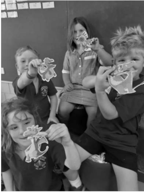
Year 1 creating Chinese dragon puppets.