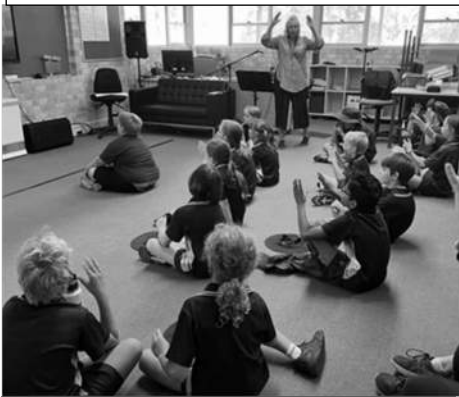
Year 4 Music around the world.