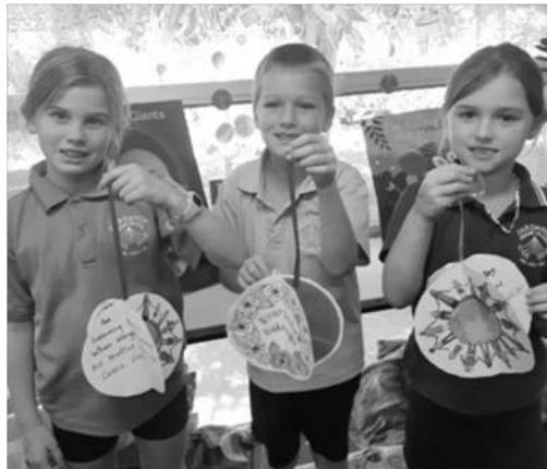
Year 2 students creating Everyone Belongs mobiles.