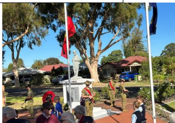
515 Cadet Unit Catafalque Party Guarding the Memorial