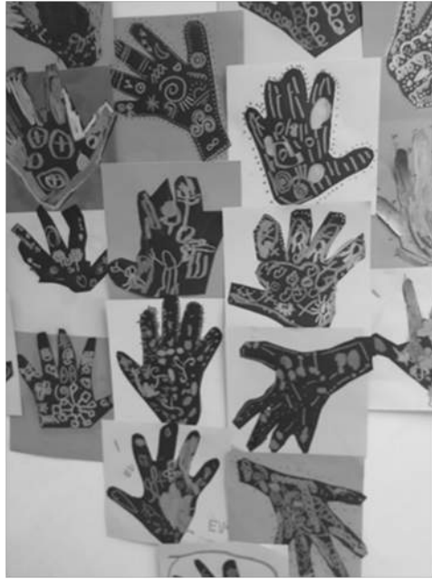
Pre-Primary students created hand- prints with their chosen tribal markings.