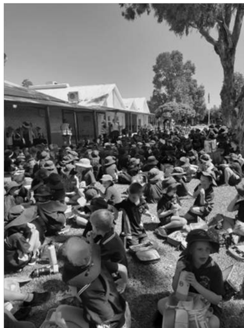
A lovely afternoon with the two schools having lunch together.