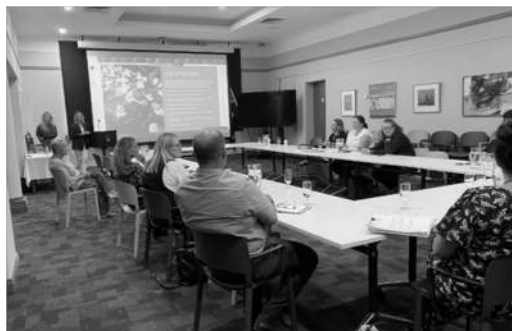
The Executive presentation attended by representatives from all Shires throughout Bun Geo

FVM and Atelier (our event manager) made an afternoon presentation to the Executives of all Shires within the BunGeo plus Australia South West, Bun Geo Chamber of Commerce, Bun Geo and SW Development Corporation. The presentation was very well received and there were many well considered questions from the audience. A great deal of anticipation and excitement was generated within the stakeholder group for the event.