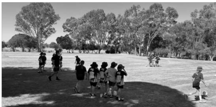
Year 5 students honing their soccer skills.