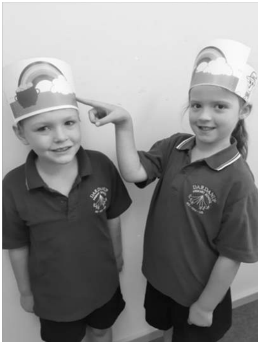
Year 1 with their Irish hats. The pot of gold at the end of the rainbow!!