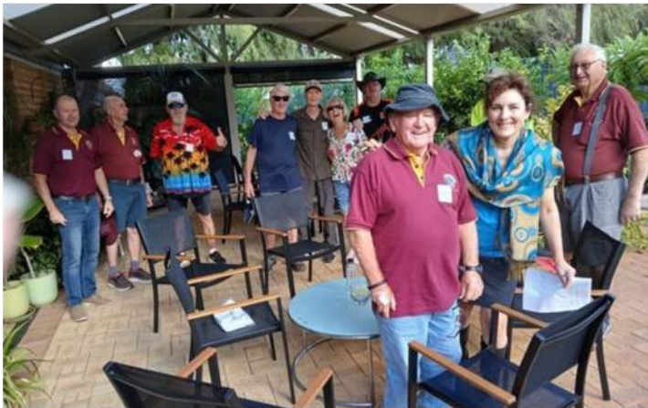
Pictured above is a group of Lions mingling with and enjoying

Solaris Cancer Care Charity in Carey Park