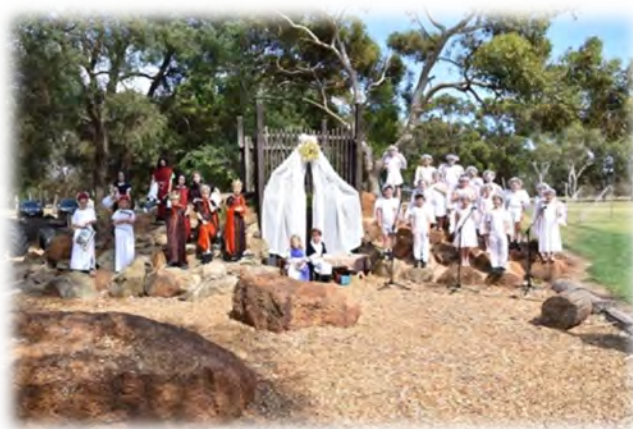
Year 1 Nativity Play