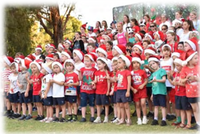
Christmas Concert 2023