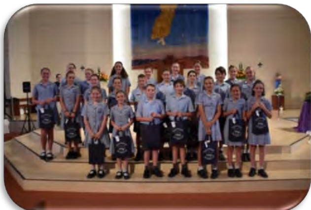
2023 Graduating Class