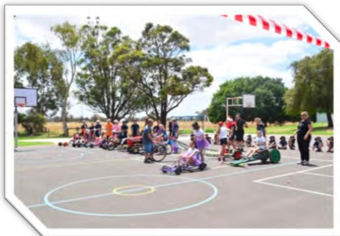
Inaugural Year 6 Go Cart Competition