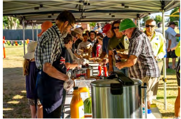
Scenes from the Dardanup Australia Day Breakfast