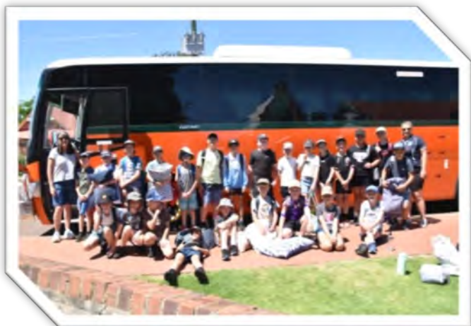
Year 5 Surf Camp

We are looking forward to students returning to school on the 31 January, for another busy school year.