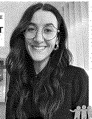
Celebration Homes South-West