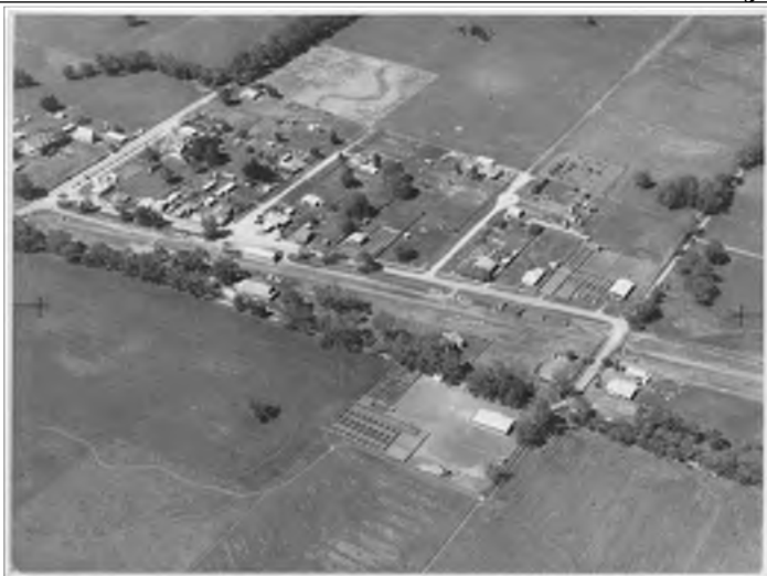
1944 aerial view of Dardanup